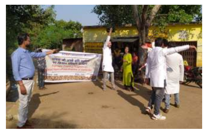
Street play organised by Spices Board Regional Office, Guna

Spices Board Regional Office, Guna, Madhya Pradesh organised an awareness programme through street play on Good Agricultural Practices (GAP) in coriander under the project titled 'Strengthening spice value chain in India and improving market access through capacity building and innovative interventions' funded by Standards and Trade Development Facility (STDF) at Negma village of Guna Tehsil in Madhya Pradesh.