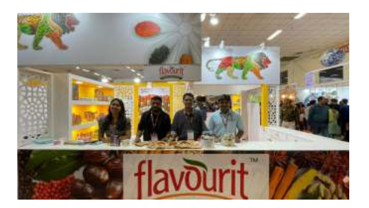
Stall put up by Spices Board in the 41st India International Trade Fair

A wide range of products and services were displayed during the event. Many government organizations participated in this exhibition and ten exporters/FPOs co-participated with Spices Board. Spices Board has put up a stall in the venue, which was visited by many participants and enquired about the Board's activities. Some visitors enquired about spices, registration and licensing, processing and general information on the spice industry. They also inquired the scope of spice export in domestic as well as international markets. The 41st edition of IITF saw the participation of nearly 2500 exhibitors from India and abroad.