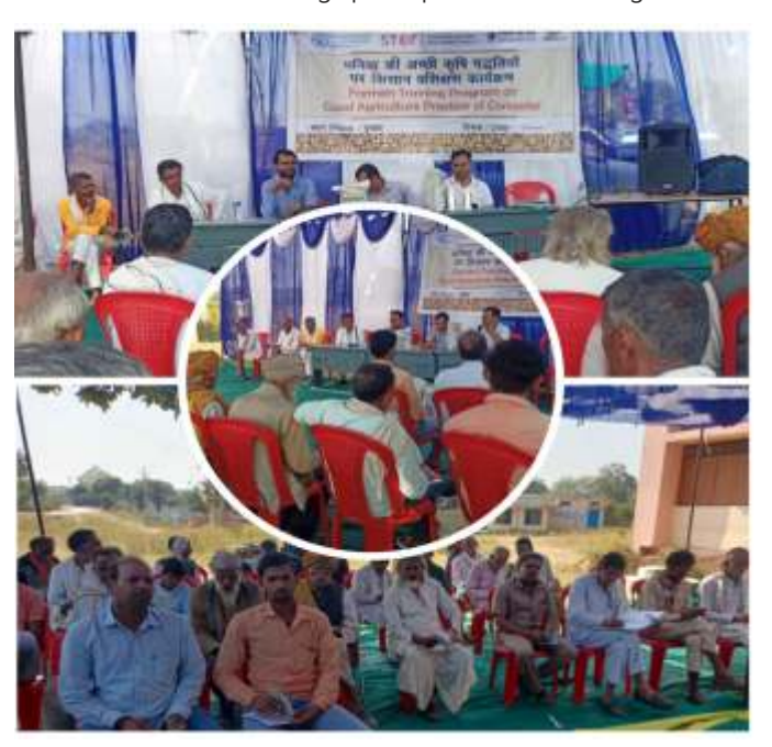
Training programme on Good Agricultural and Good Hygienic Practices (GAP and GHP) of coriander

Spices Board Regional Office, Guna, Madhya Pradesh conducted a training programme on Good Agricultural and Good Hygienic Practices (GAP and GHP) of coriander. Around 100 farmers from Gulwada village participated in the training.