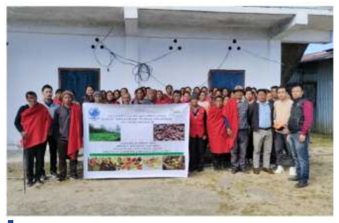
Participants after the quality improvement training programme on Large Cardamom

Spices Board Field Office, Kohima, Nagaland conducted a quality improvement training programme on Large Cardamom at Seyochung village, Kiphire district, Nagaland on 22 November 2022. Around 58 farmers attended the training programme.